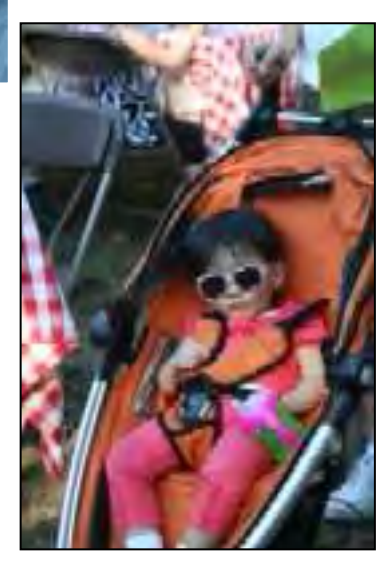
A good time was had by all...to the very end \textcircled{\sc o}