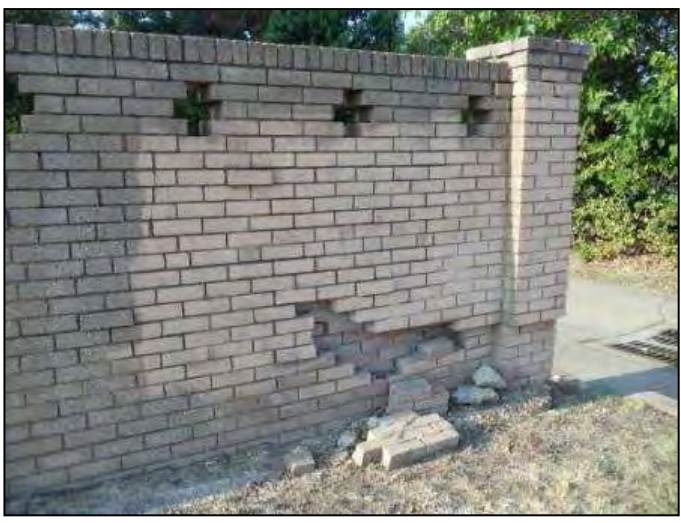
* * *

Further Forest Lane repair to be considered: