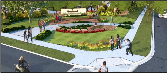
Rendering of the new Forestwood Development.

Below are highlights of progress to date: