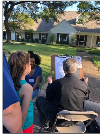
Above: HNA kids wait patiently to get their caricature drawn