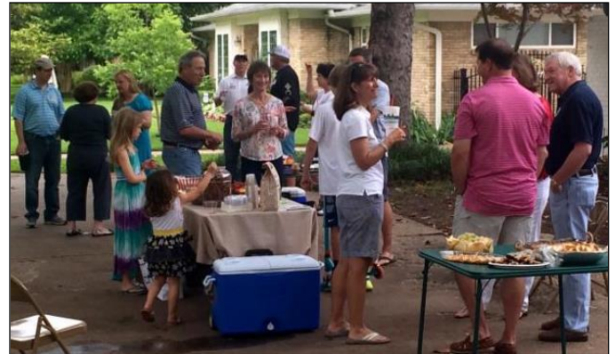
Hallmark Block party in May of 2016.

HNA members approved a 2018 Budget which includes funding to support Block Parties.